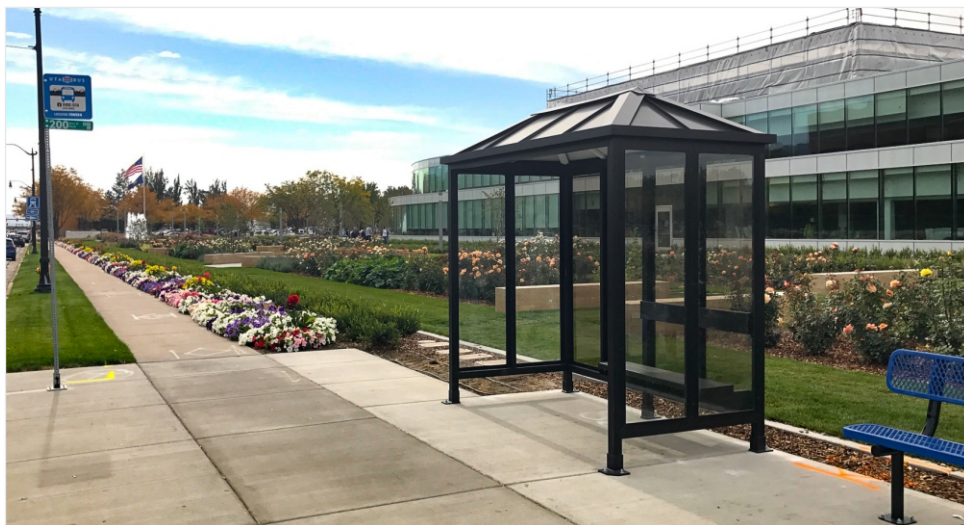
Bus stop improvements on Route 200

In Ogden, Routes 603 and 612 now feature 15-minute service, allowing better connections between the Ogden FrontRunner station and Weber State University. Route 470 began offering improved service to Weber, Davis and Salt Lake counties, with 30 minute service on Saturdays.