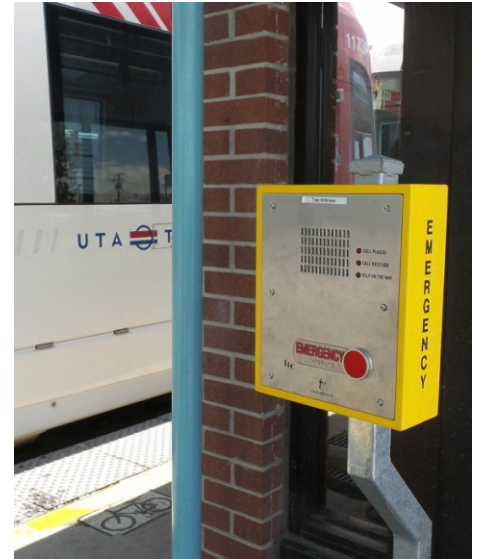
Safety First – safety call boxes are placed at 50 rail stations

Safety First: Continuing efforts that began the previous year, UTA replaced the concrete edges on its older platforms in 2015, which had deteriorated after 15 years of use and exposure to the elements. The platform edges were replaced by longer-lasting materials, ensuring platforms will remain in good condition for many years to come.