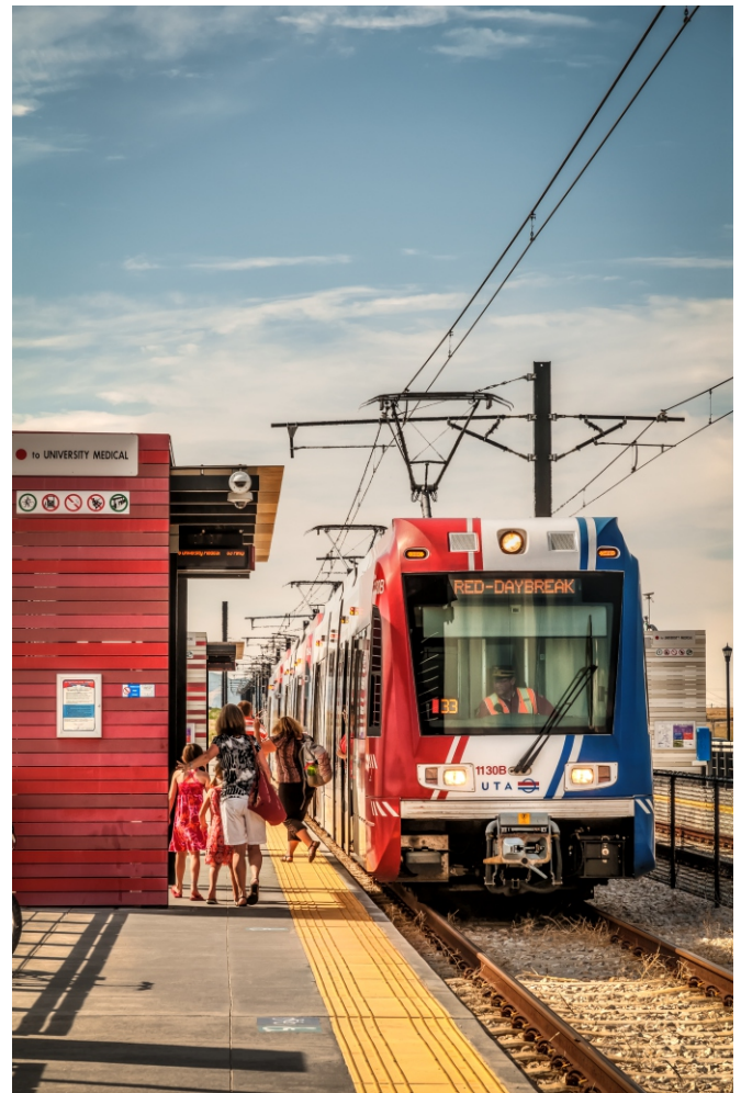
TRAX at Daybreak Station

As UTA continues to evaluate future fare